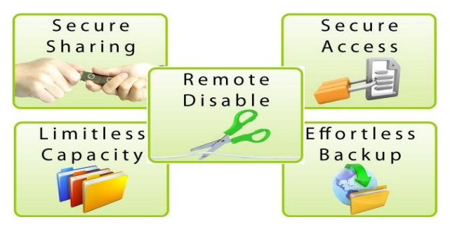
Fig. 2. iTwin Features