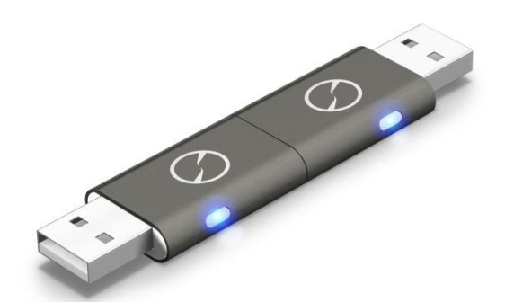
Fig 3. iTwin Device

Most of the mobile professionals and individuals that want to access their files and information in spite of where they are, select cloud services for backing up and storing important documents. A cloud service is suitable and enables you to access your files from some device with an Internet connection. Many cloud service providers deploy security technologies to guarantee their customers that documents are securely transmitted and stored. On the other hand, not anything is one hundred percent perfect that means a device like iTwin Connect can help you cover up all of your bases in the event of data break or